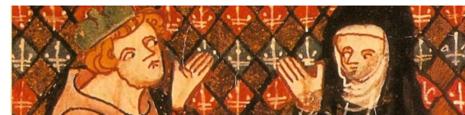
Forum for Medieval and Renaissance Studies in Ireland